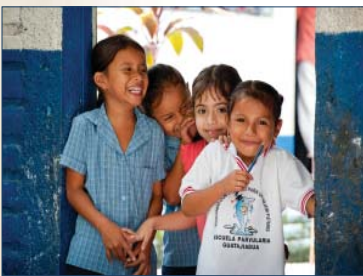
Life is not easy for most children in El Salvador, but your devotion to improving the quality of their lives is bringing smiles to many more faces.