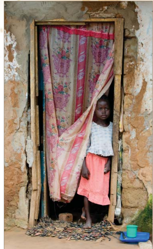
Every child should be able to have hope. Clean water, sanitation facilities, and hygiene education go a long way toward improving their health and giving them that hope.