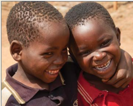
Your support of the Zambia Water, Sanitation, and Hygiene project is putting smiles on a lot of faces.

Sources: United Nations, World Health Organization, World Food Program, and World Factbook