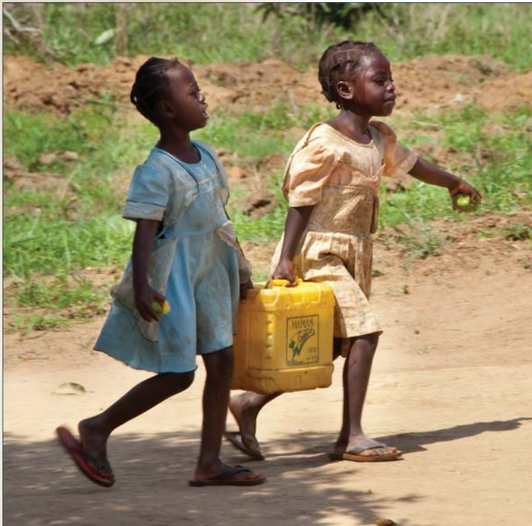
These girls are carrying home a heavy container of water from a new well. The well greatly shortens the distance they have to travel and the time they must spend each day gathering water.