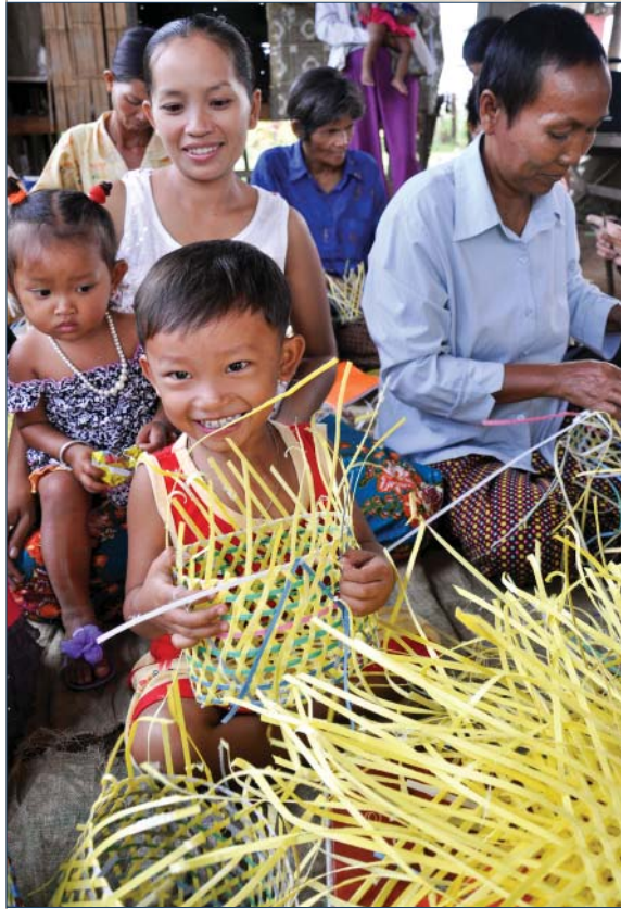
Members of a VisionFund community bank in Chhrobok Mease village get together to weave baskets. The extra income they generate will benefit their children.

Education: Helped 592 parents understand the value of education; supported 1,843 children with scholarships and school-related materials; maintained five sites for providing nonformal education to children who live in remote